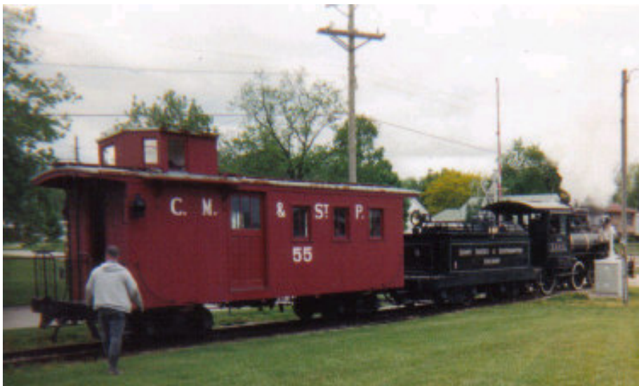
The MCRR crew takes the Bellevue & Cascade Caboose out for a spin.